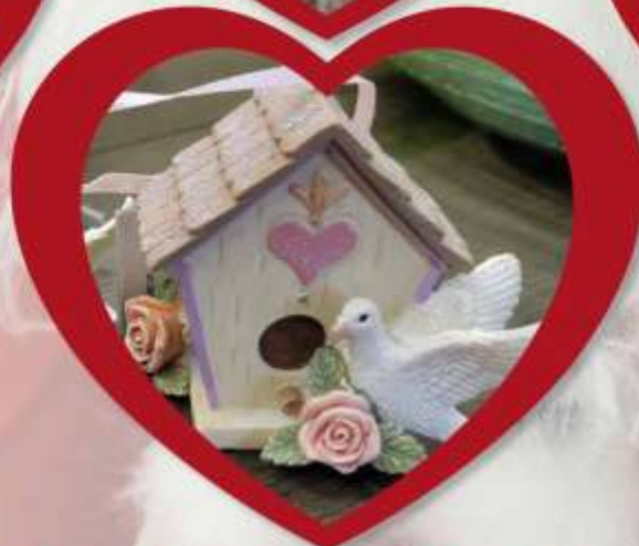
Gnomes & Disney Characters

308 E. Main St. • Montrose, Colorado • 970-765-7572