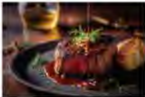
Lighthouse Eatery 970-964-7570