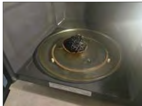
Charred results of a forgetful cook.

-Keep a close eye on what you're cooking; never leave cooking food unattended. For foods with longer cook times, such as those that are simmering or baking, set a timer to help monitor them carefully; -Clear the cooking area of combustible items, keeping anything that can burn -