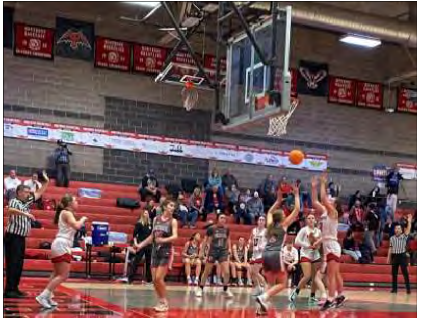
Tigers and Red Hawk girls fight for a rebound in Red Hawks' 32-point victory.