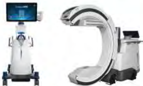
Featuring the revolutionary Excelsius3D and ExcelsiusGPS robotic systems for minimally invasive and complex spine surgeries

Return to the life you want with the most advanced care available. Right here in Montrose.