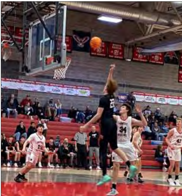
Grand Junction Tigers and Red Hawks boys fight for a rebound in triple overtime 40-38 loss at the fieldhouse.